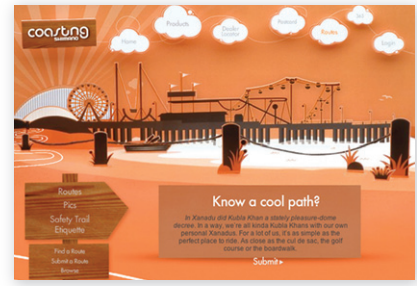
A SKETCH (left, seat plus helmet storage) and a PROTOTYPE (middle) show elements of Coasting bicycles. Shimano's Coasting WEBSITE (right) points users to safe bike paths.

an activity that was simple, straightforward, and fun. Coasting bikes, built more for pleasure than for sport, would have no controls on the handlebars, no cables snaking along the frame. As on the earliest bikes many of us rode, the brakes would be applied by backpedaling. With the help of an onboard computer, a minimalist three gears would shift automatically as the bicycle gained speed or slowed. The bikes would feature comfortably padded seats, be easy to operate, and require relatively little maintenance.